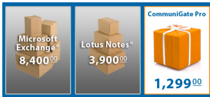
Price comparison based on publicly available prices from Microsoft and IBM and are calculated for 25 users.*